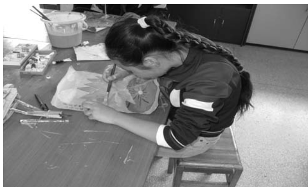
Personal Choice Art Class- When I admired this child's Lotus Blossom, she insisted on giving it to me.