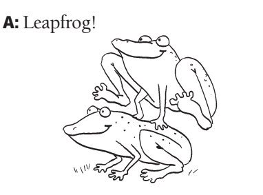
© 2020 Resources for Educators, a division of CCH Incorporated